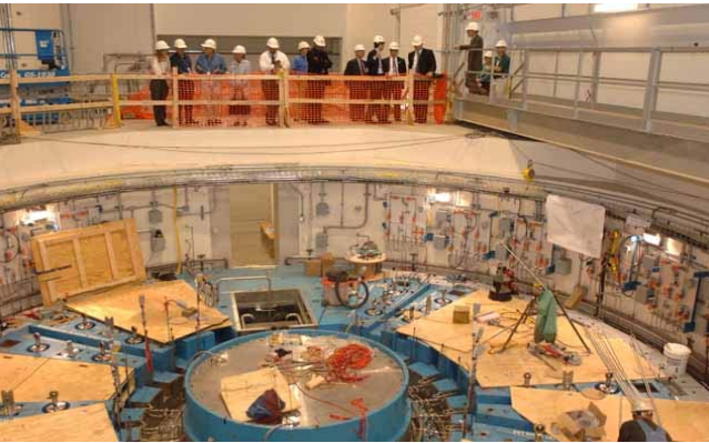
Spallation Neutron Source