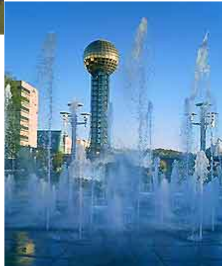
Sunsphere Tower World's Fair Park